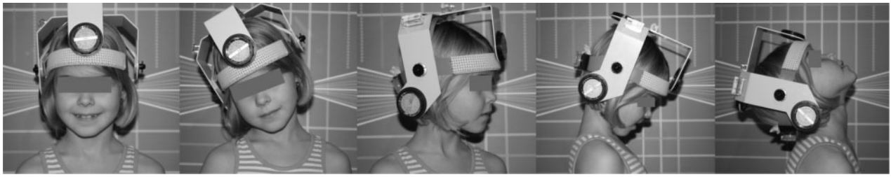
Figure 1 Keno ® -cervical measurement instrument.

procedure for all six standard movements. They were also given a trial practice run to ensure familiarity with the testing protocol. Each child was instructed to sit in an erect posture on a plinth, with the thighs fully supported and the arms relaxed at the sides. Subjects were asked to keep the trunk stationary. If necessary the movement was corrected by the examiner to ensure movement of the head in only one plane. The examiner manually and verbally cued the subject's head movements so that, to the best visual estimate of the tester, the subject's chin, nose and eyes moved evenly in one place. The child was asked to move his/her head as far as they could comfortably go. After each movement, the subject was asked to return to the starting position. Each movement was performed once.