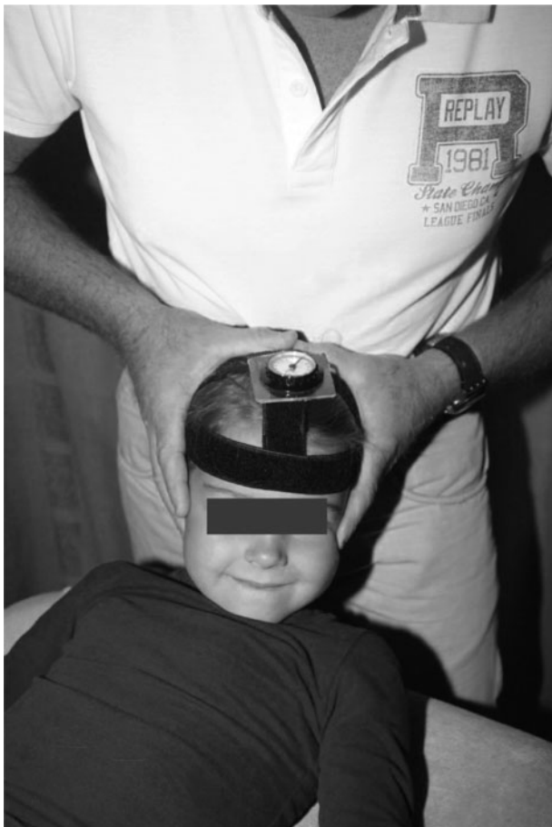
Figure 2 Flexion-rotation test (FRT).

Following this, the FRT was performed in supine (Fig. 2). The testing procedure was based on previous